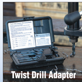
Twist Drill Adapter